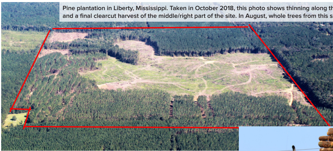
Pine plantation in Liberty, Mississippi. Taken in October 2018, this photo shows thinning along the bottom/left part of the harvest site and a final clearcut harvest of the middle/right part of the site. In August, whole trees from this site were tracked back to Drax Amite.

An independent, on-the-ground investigation of Drax's pellet mill in Amite, Mississippi ("Drax Amite"), not associated with SIG's analysis, helps explain what it means for Drax to source from thinning of non-industrial pine plantations. As documented during that investigation, Drax's "thinnings" include large, whole trees up to 35 and 45 feet tall and 14 inches in diameter.