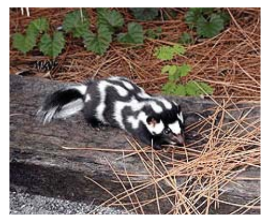
Figure 2. Eastern spotted skunk Spilogale putorius