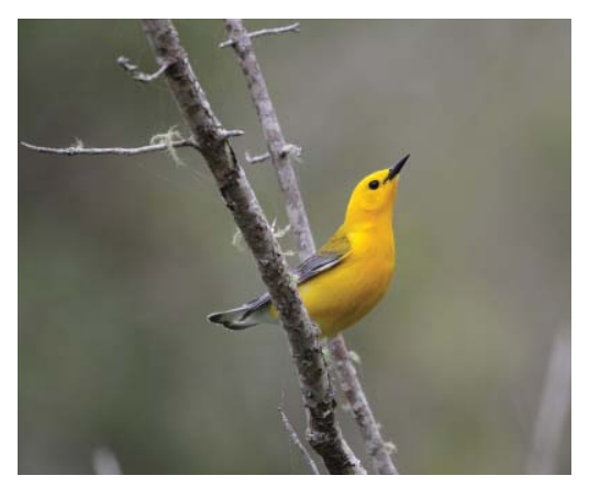
Figure 4. Prothonotary warbler Colinus virginianus.